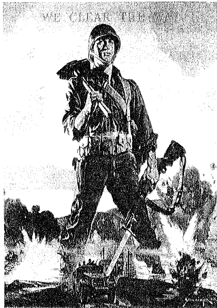
Poster from the 1995 Victory Edition, VFW calendar

Would things have been different if Hill 805 had stayed in U.S. hands? The answer is probably "yes," but we can not know how different, for history does not speculate.-- Editor