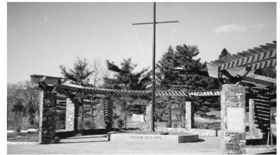
The Place of Flags

I visited the site on a cold day in February yet found visitors at the site. It is quite serene and peaceful and I would imagine it to be lovely in the spring. If you find yourself in the Worcester area, the memorial can be found off Rt. 9 on the east side of the city. It is well worth the stop.