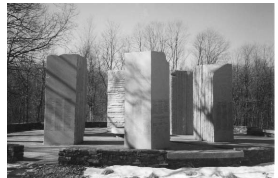
The Place of Names