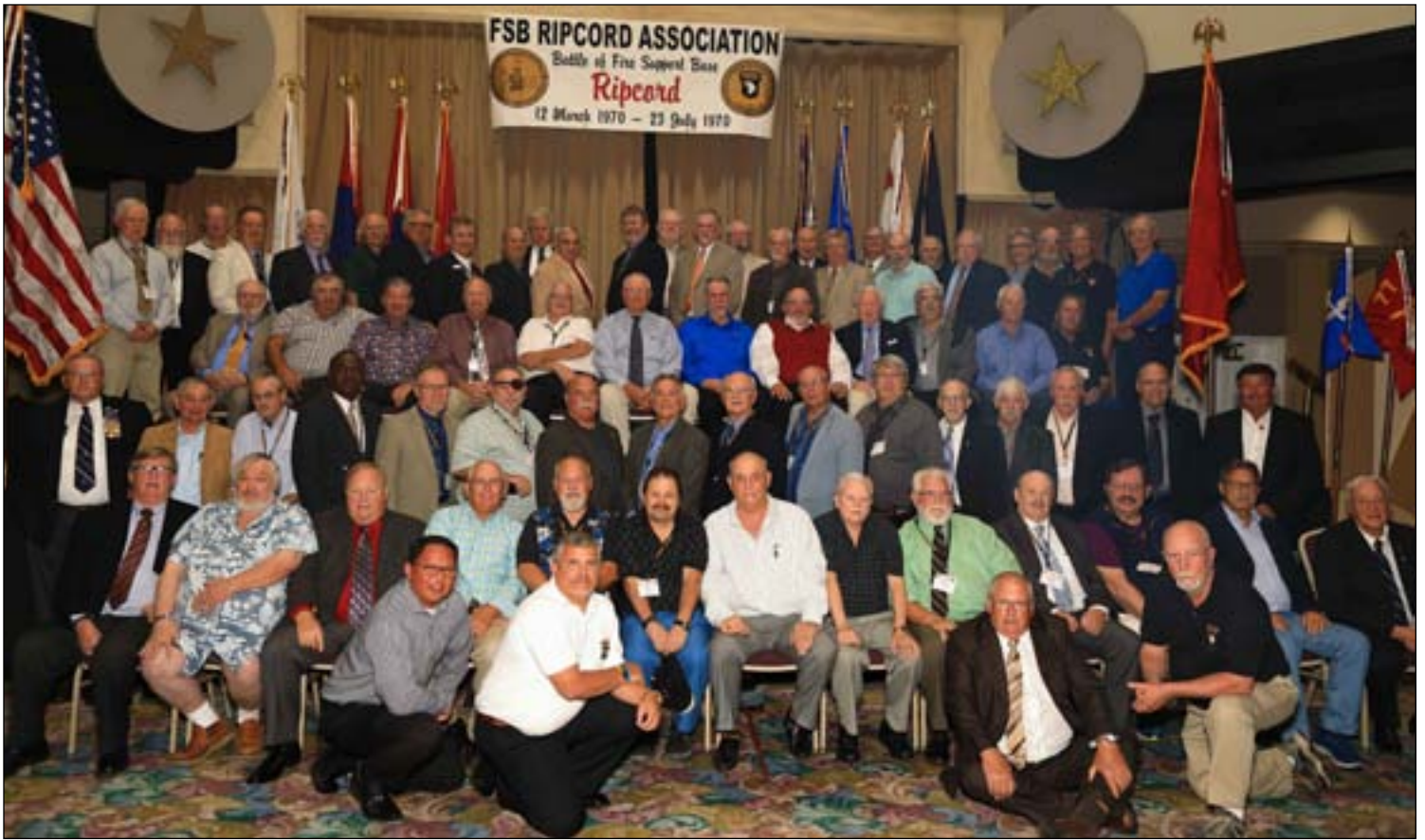
Ripcord Veterans 2017 Laughlin, NV