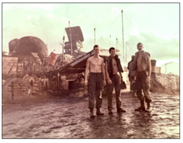
Before Chinook crash