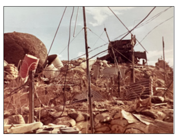
After Chinook crash