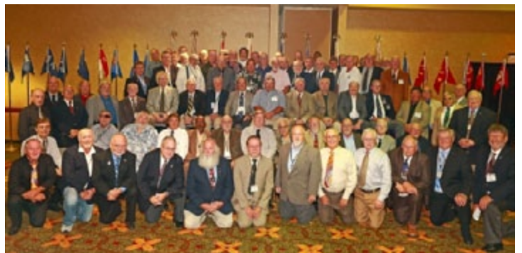
2015 Springfield, MO