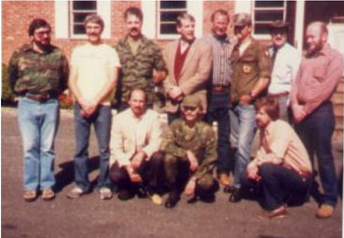
1986 Whippany, NJ