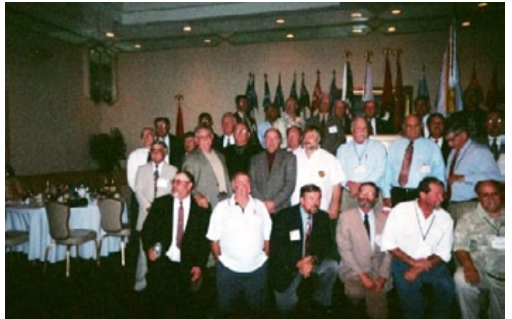
2003 Charleston, SC