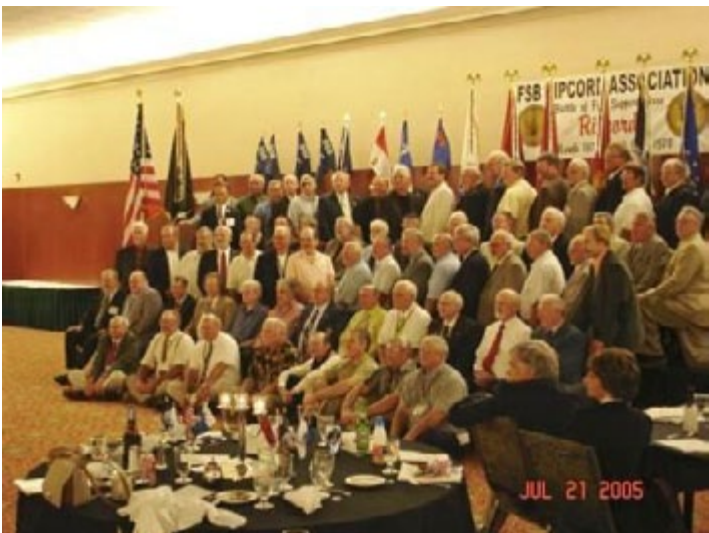
2005 Indianapolis, IN