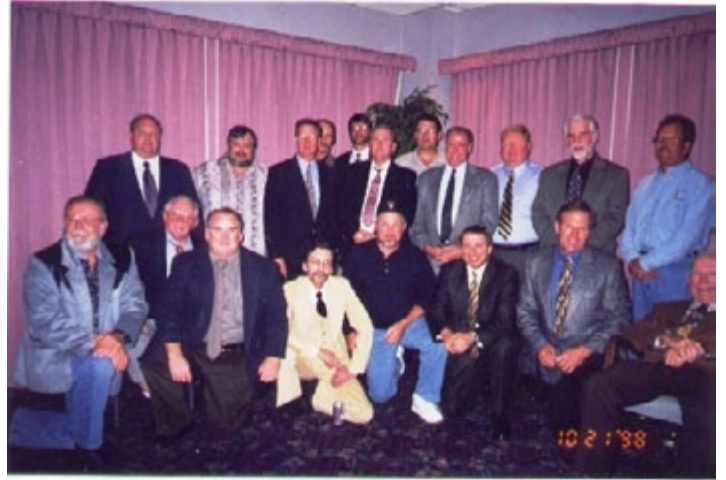
1998 Atlantic City, NJ