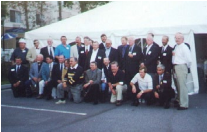
1999 Savannah, GA