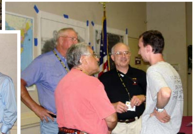
Ripcord Vets telling the Iraq Vet how it was.