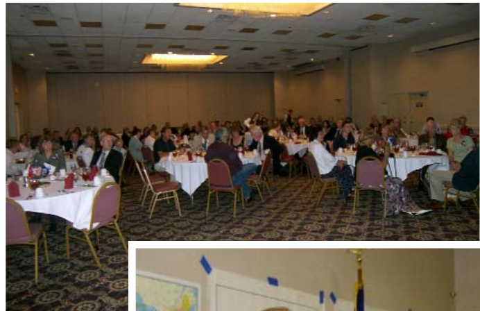
The Saturday Night Banquet.