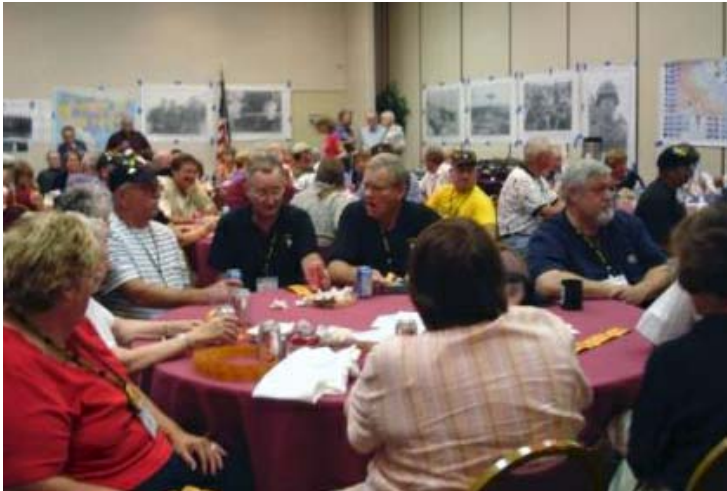
Ripcord gang gets acquainted with old friends in the hospitality room.

But the best thing for the week was of course seeing all the guys once more. We ended up with 10 new attendees!