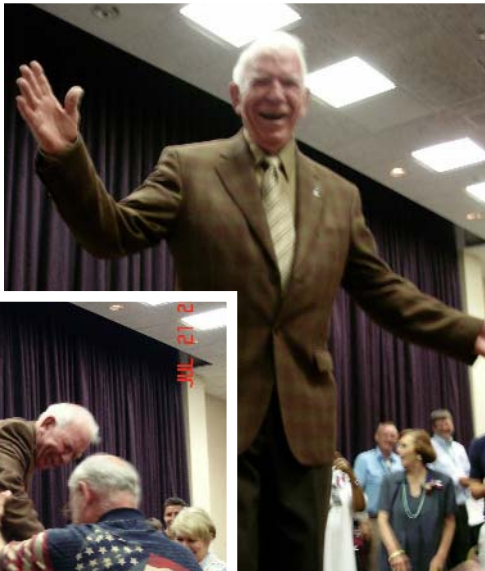
Below and right: The General gets his funk on!