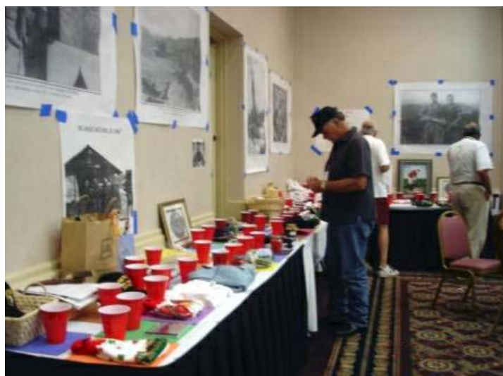
Attendees look over the items offered in the Ripcord Raffle on Friday night.

If you are planning to attend next year and are able, try to bring an item for the Chinese Auction. Crafts are welcomed and they do not have to be military in nature to be popular.