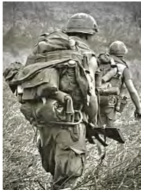
Photo represents what many of our rucks looked like. Not actual photo of us in Alpha Company.