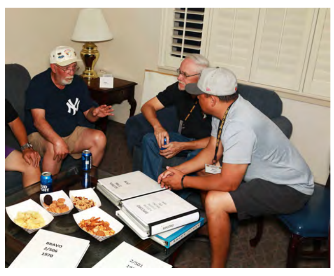
"There I was all alone..."