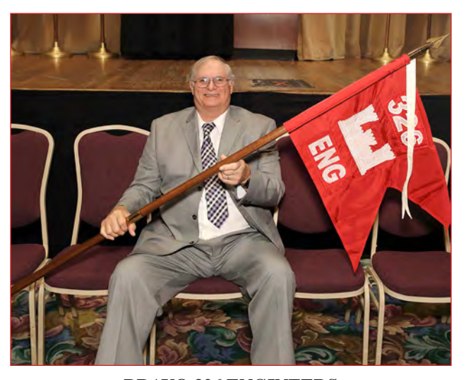
BRAVO 326 ENGINEERS