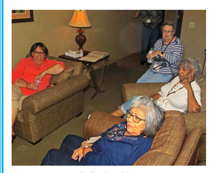
Ladies in waiting