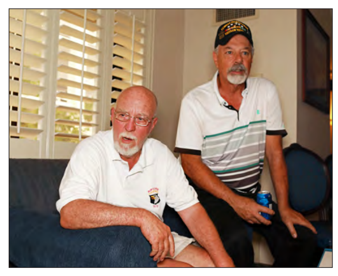
Same company, different view.