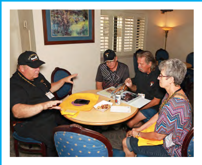
There I was... flying through the air!!!