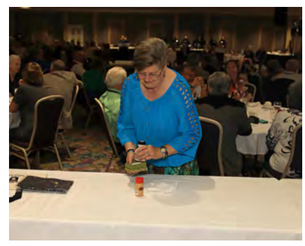
Star Marshall finds something good