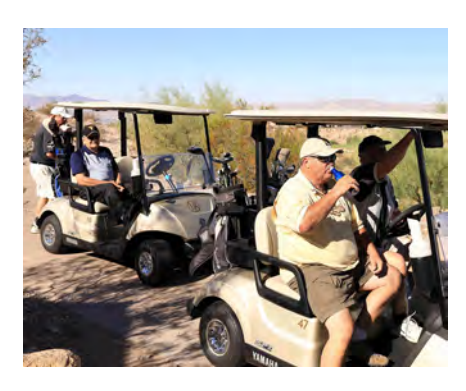
They are OK at golf but great at drinks & riding carts!