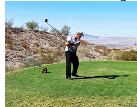
Heath demonstrated the Arizona drive!