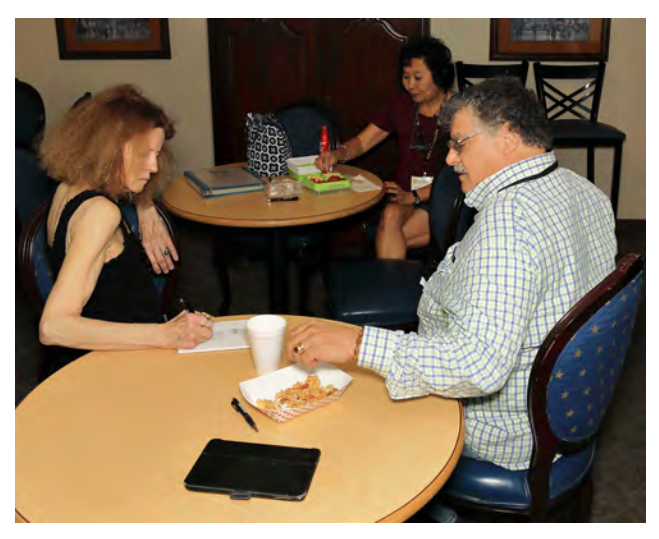
Murphy.. this is what needs to be done!