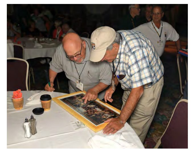
Now, who is this?