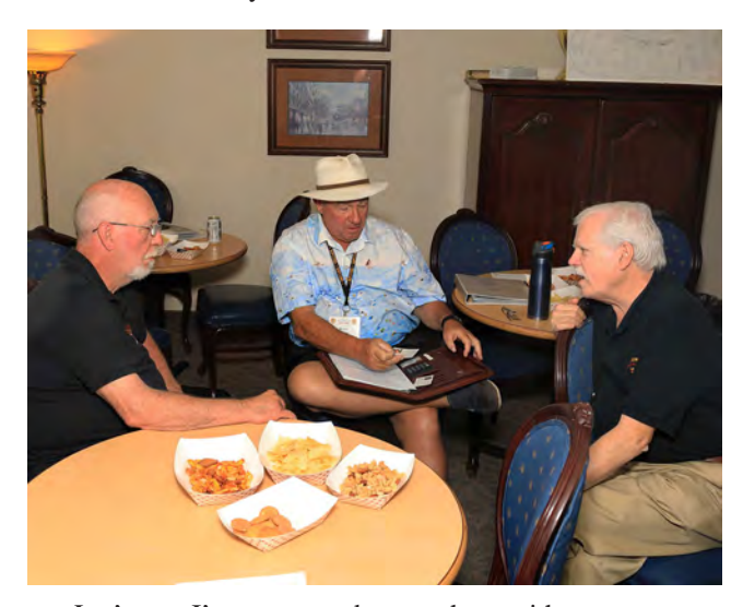
Let's see, I've got a card somewhere with my name