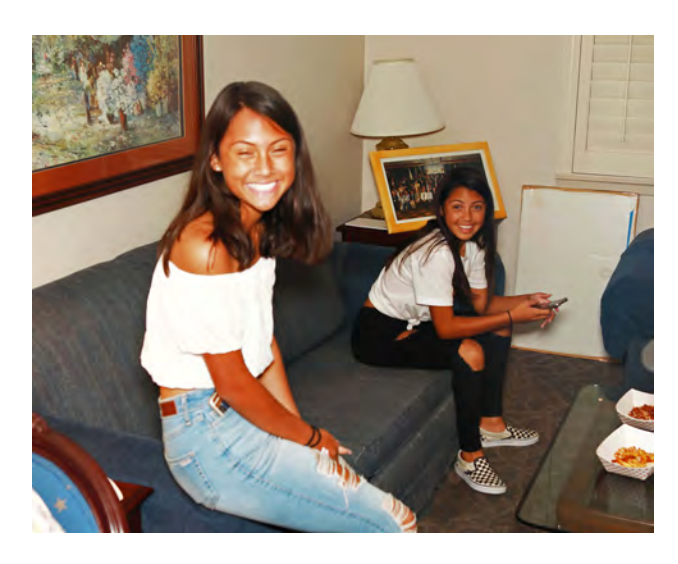
Ask grandma for some "solid clothes".