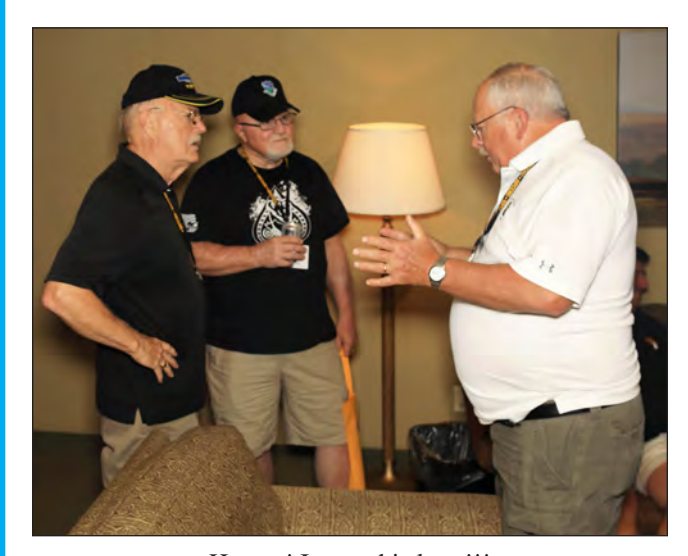
Honest! It was this long!!!