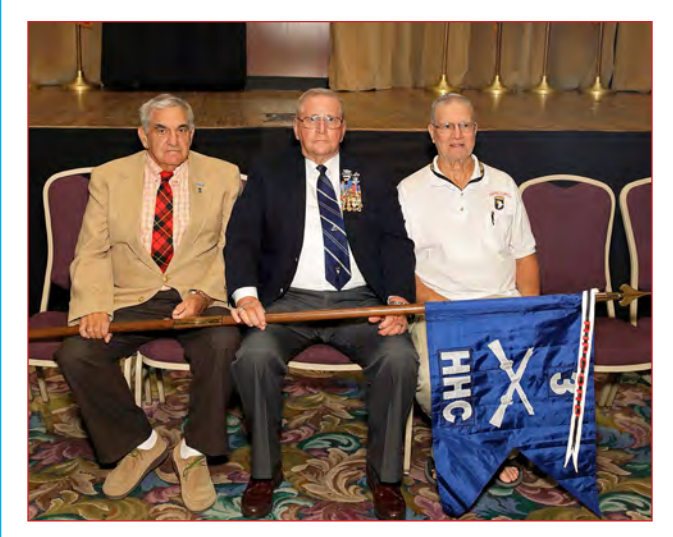
3RD BRIGADE HHC