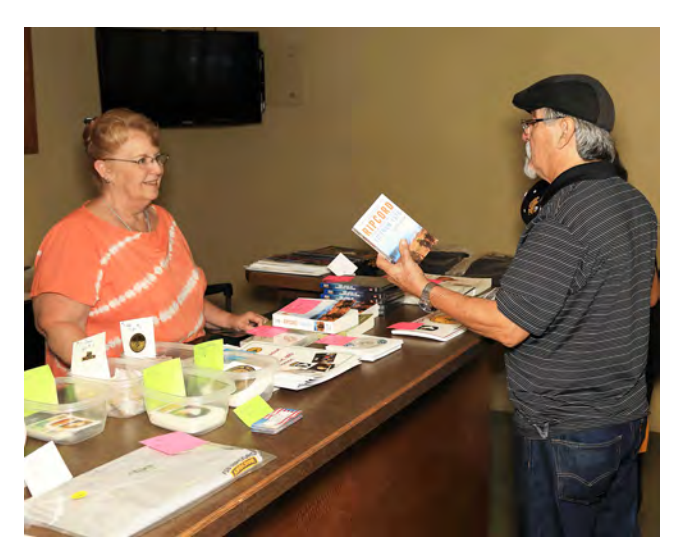
You want How Much for this book?