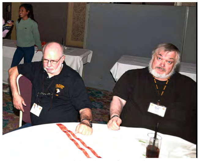
So many tickets but so far no winner