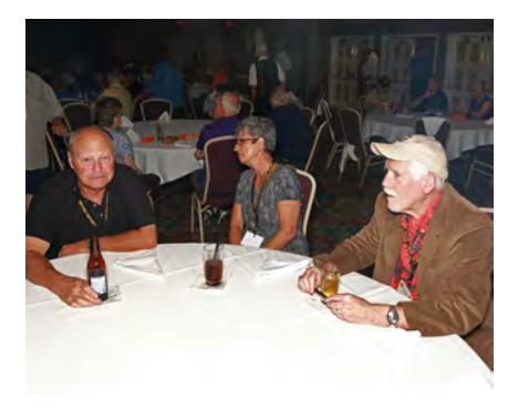
Seems like more fun over there