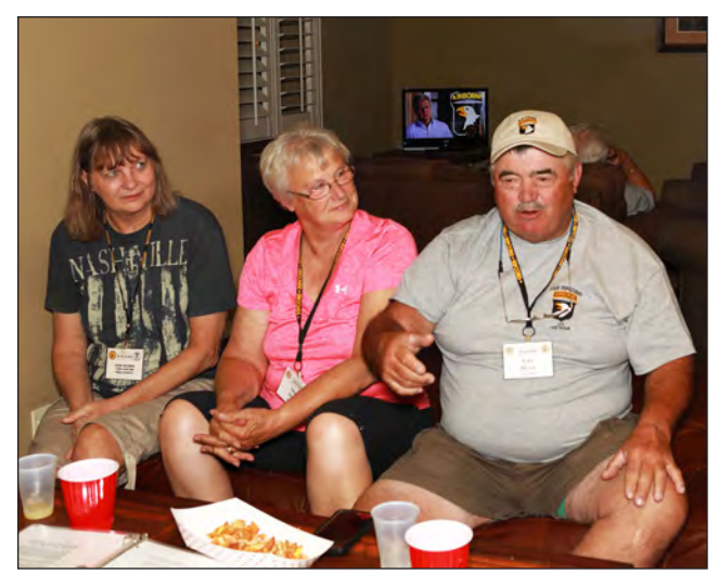
"Don't believe them! I hit the golf ball far!!"