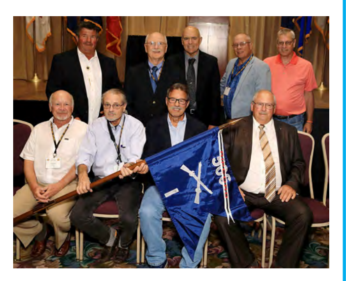
BRAVO & DELTA 1/506