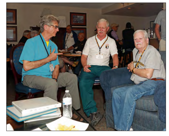
Gunn is still shooting