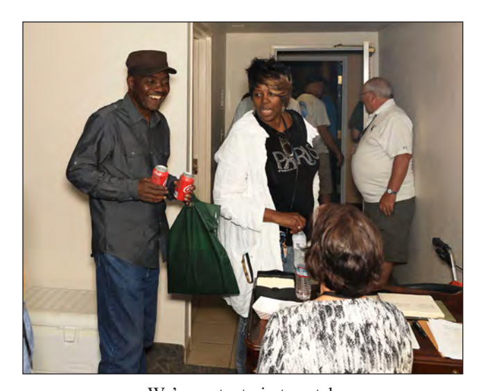
We've got a train to catch