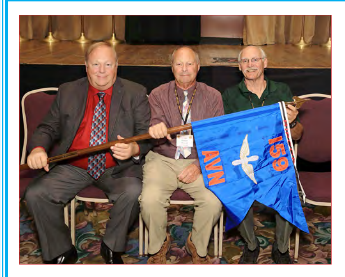
ALPHA 159 ASHB