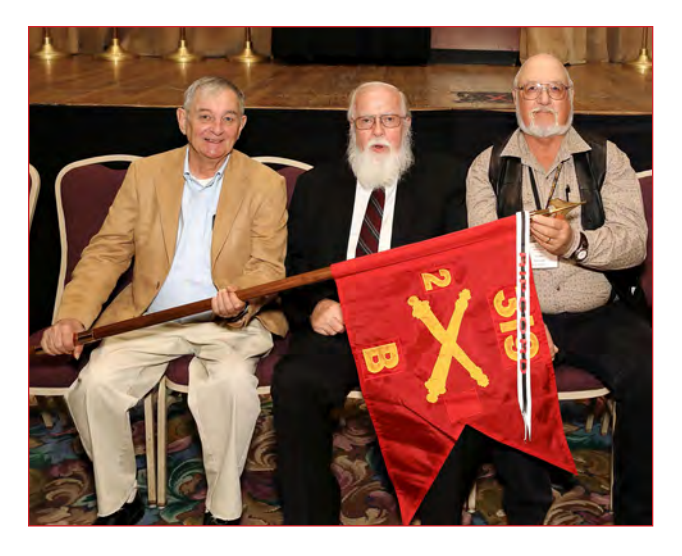
BRAVO 2/319 FIELD ARTILLERY