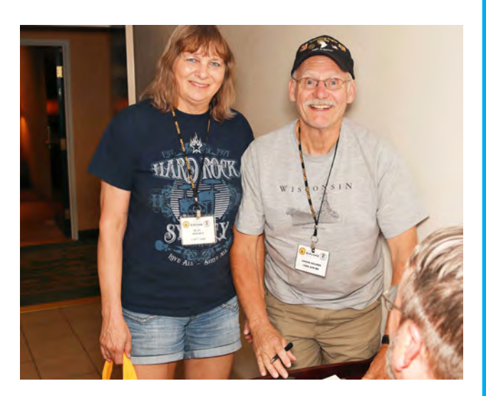
Man! We are happy to be here!!!