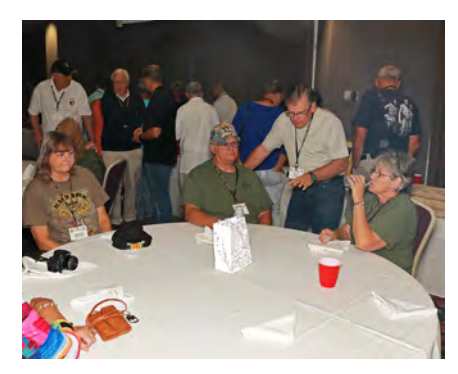
"Now, here is how you win..."