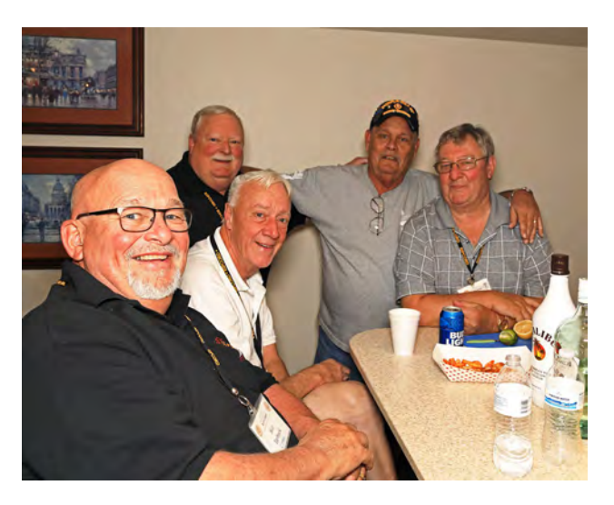
Good food, drinks and friends.