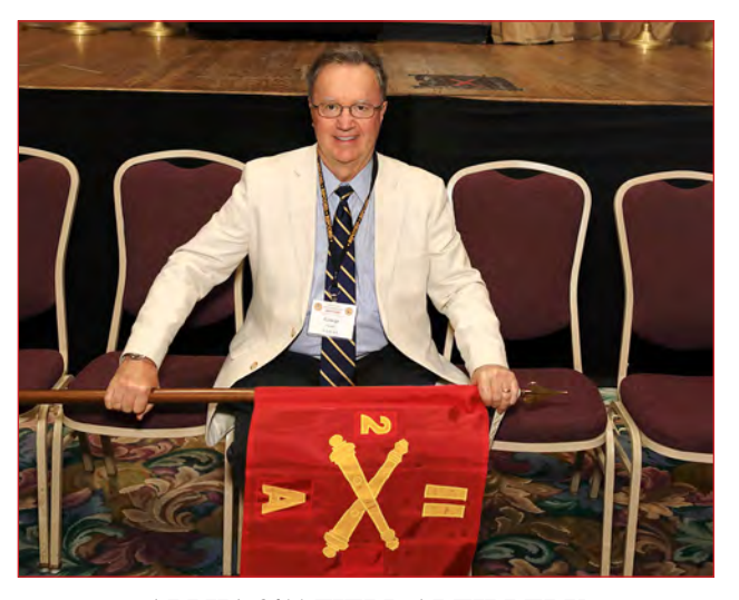
ALPHA 2/11 FIELD ARTILLERY