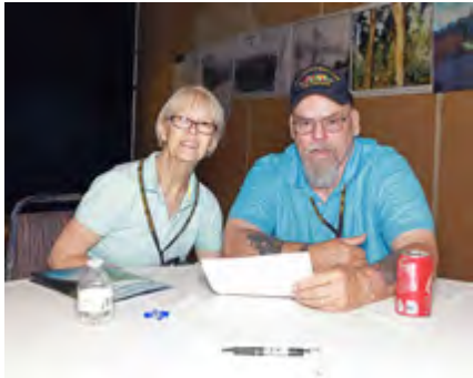
What do you mean this is my bill.