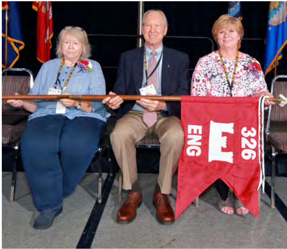
B 326 ENGINEERS