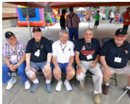
Did we catch them at something.