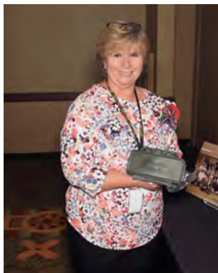
Claymore mine replica.