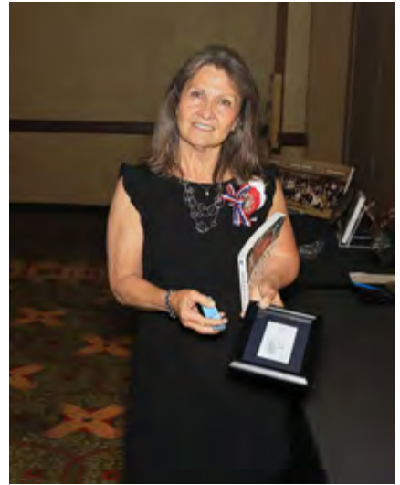
A sketch by Dicken.