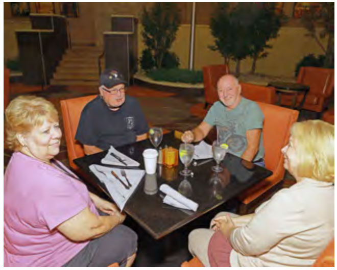
The artillery clan plans a raid.