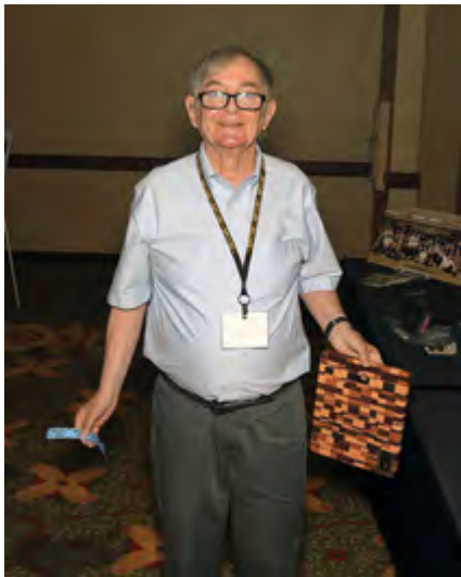
The Maine winner.