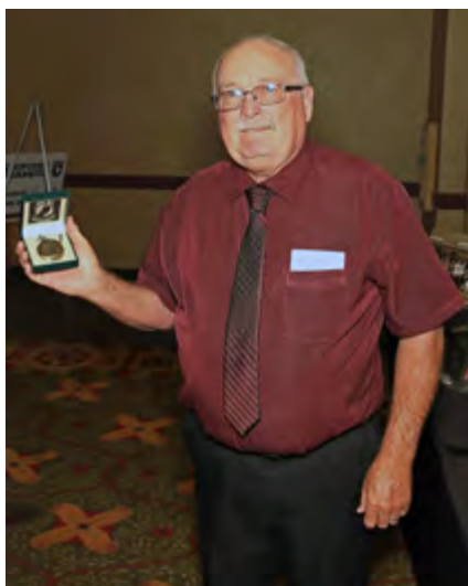
Time check, please.