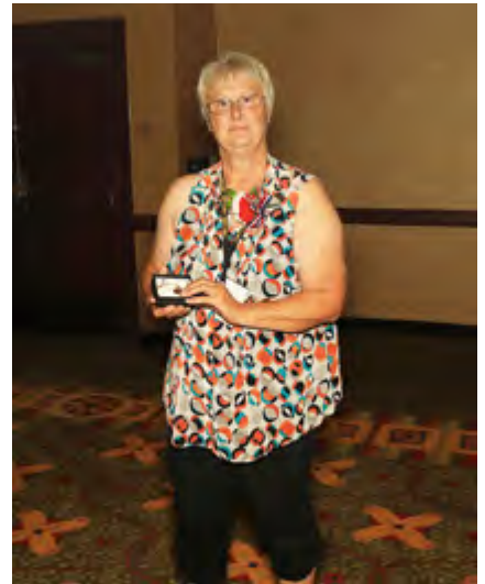
Something for Iowa.