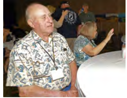
All quiet in the mortar pits.