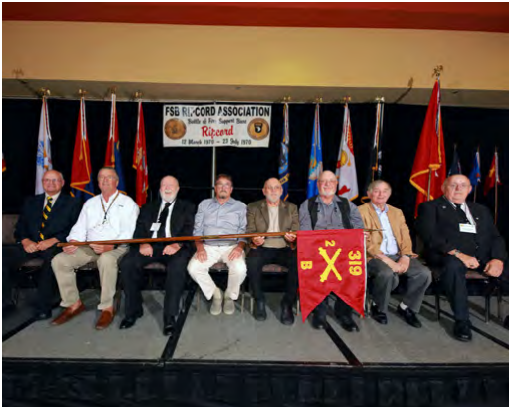
B 2/319 FIELD ARTILLERY