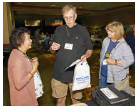
I can't believe I won!