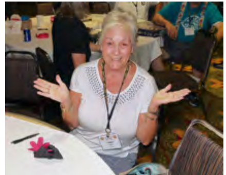
Plenty of tickets, but no winners!