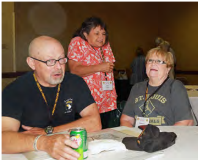
Somebody is cold or sneaky.