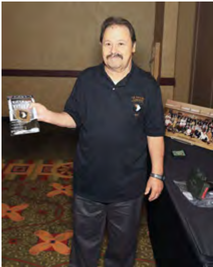
Made with Alaska gold.