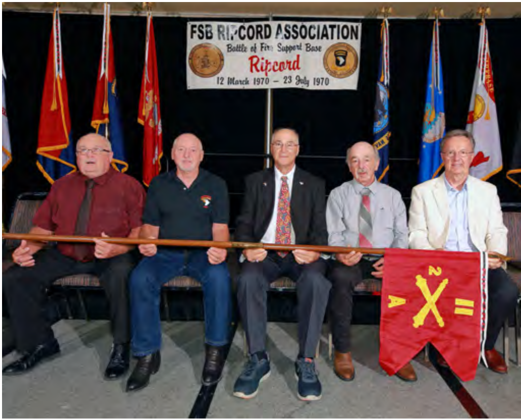
A 2/11 FIELD ARTILLERY