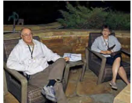
The Millitellos on break.