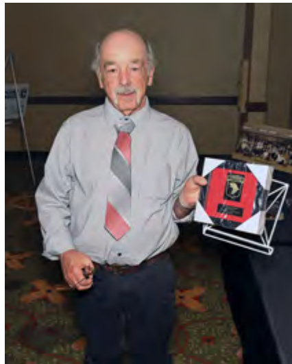
Even the Redlegs win.