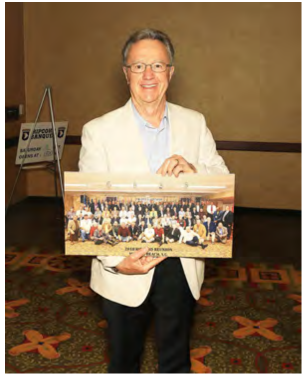
I just need to find a place for this.