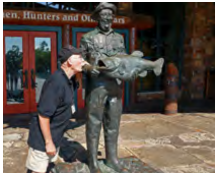
Ripcord fishing technique.