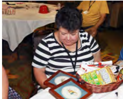
Plenty of tickets, but no winners!