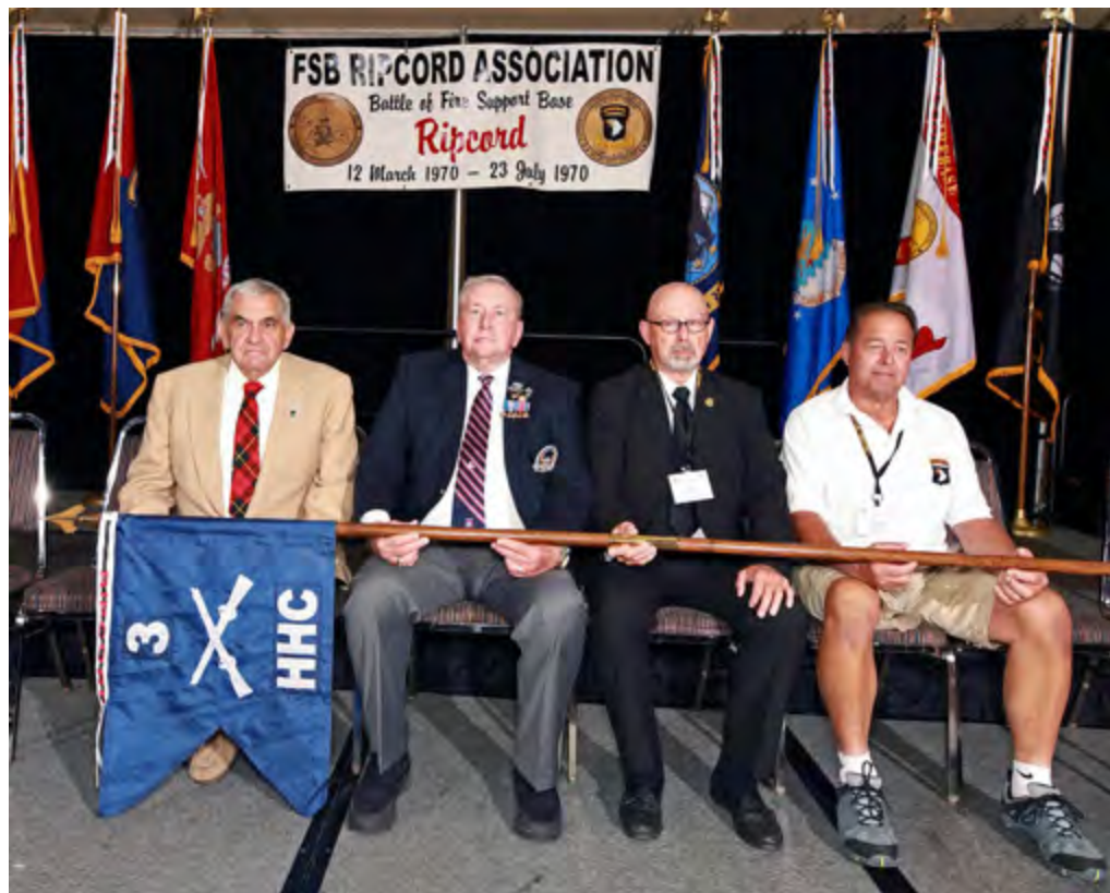
3rd BRIGADE HHC