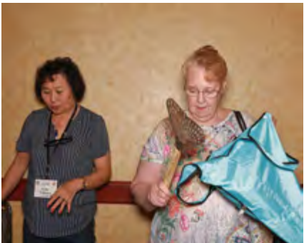
A sack, fly swatter and two women on a Snipe hunt.