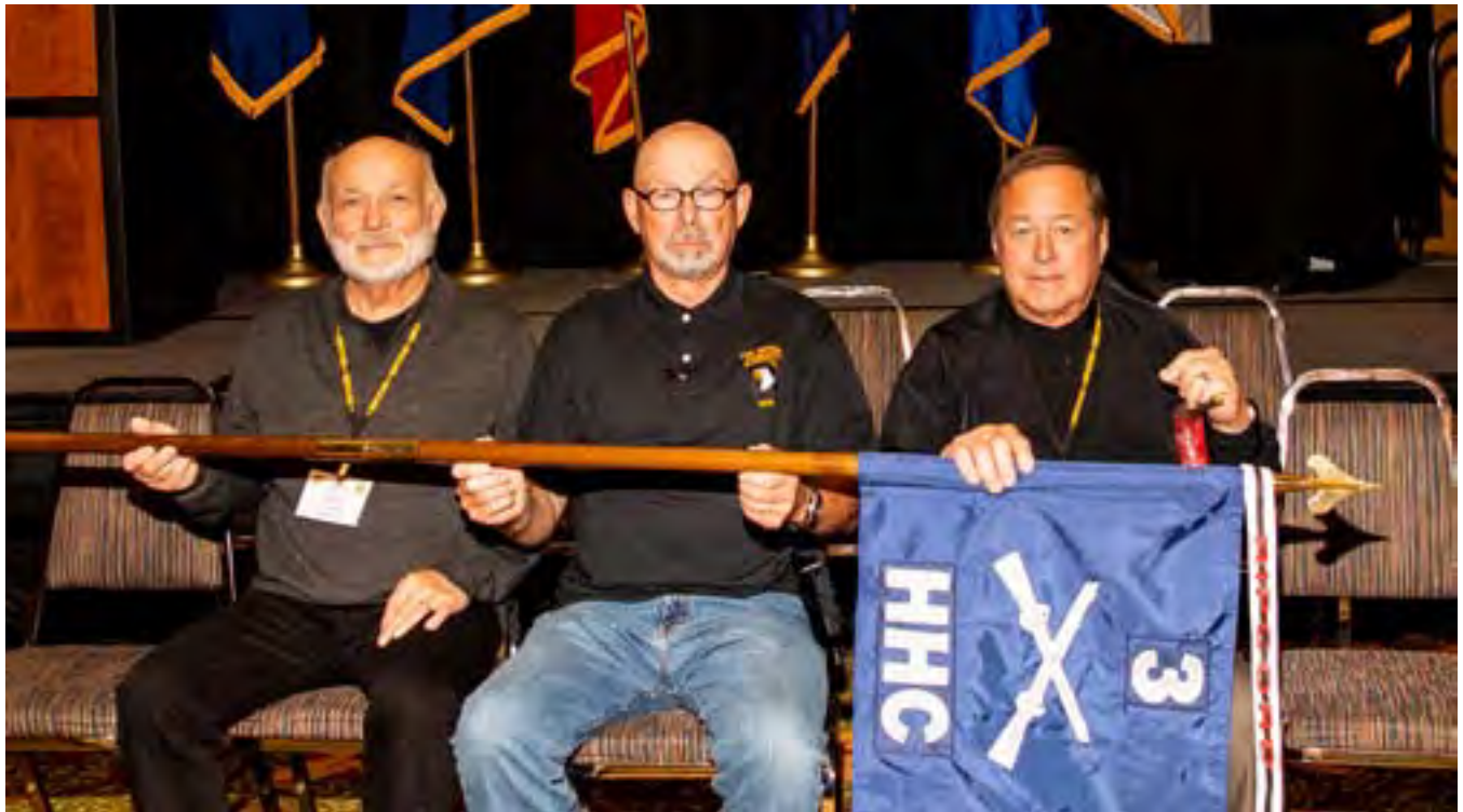
3rd BRIGADE HHC