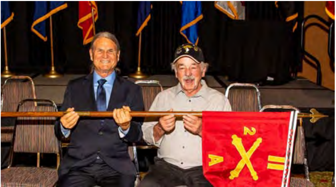
A 2/11 FIELD ARTILLERY